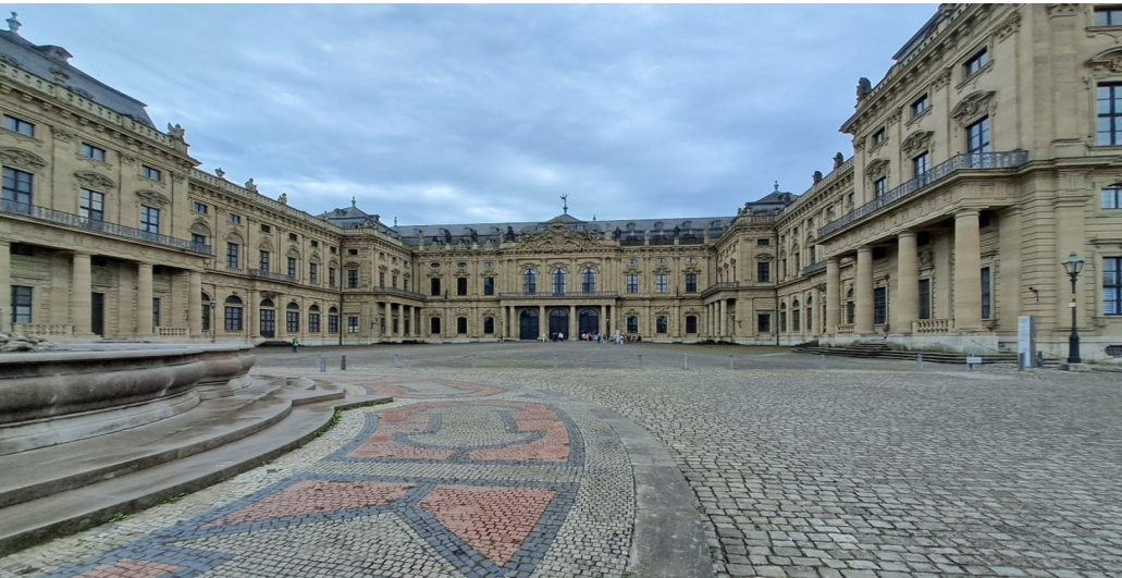
This is a picture of the residence from the outside.