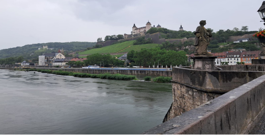
This is a picture of the prince bishops old castle.