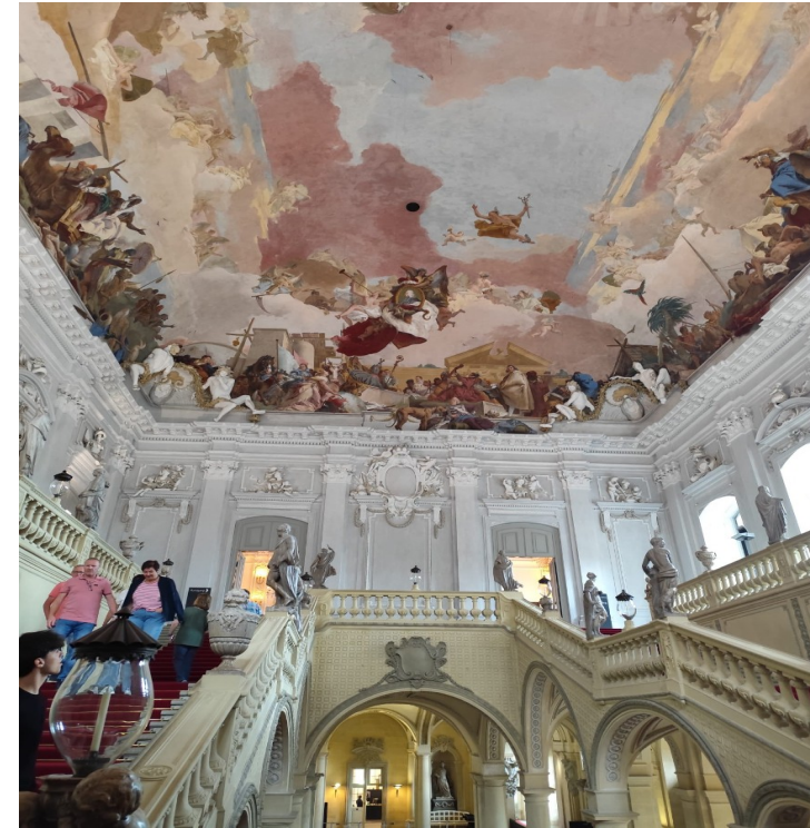
This is a picture of the great painting inside the residence at the staircase.